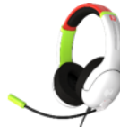
Nintendo Switch Radiant Racers Airlite Wired Headset