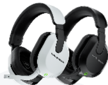
Stealth 600 Multiplatform Wireless Headset