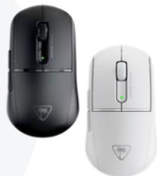
Burst II Air Wireless Mouse