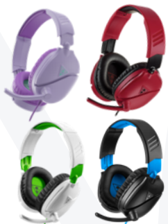
Recon 70 Multiplatform Wired Headset