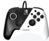
Nintendo Switch OLED Rematch Controller