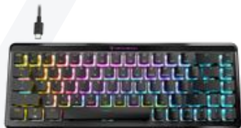
Vulcan II Mini Air Optical Wireless 65% Mini Keyboard