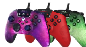
REACT-R Wired Controller for Xbox & PC