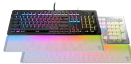
Vulcan II MAX Premium Optical Wired Keyboard