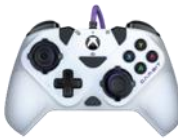
Victrix Gambit Dual Core Tournament Controller