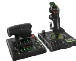
VelocityOne Flightdeck Premium HOTAS Controller for PC