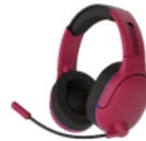
PS5 & PC Airlite Pro Wireless Headset