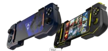
Atom Controller for iOS & Android