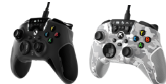
Recon Wired Controller for Xbox & PC