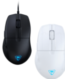
Pure Air / Pure SEL