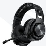
Atlas Air Wireless PC Headset