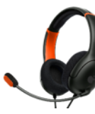
Xbox Series XIS & PC Airlite Headset