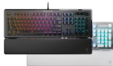
Vulcan II Mechanical Wired Keyboard