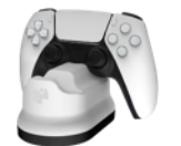
PS5 White Metavolt Dual Charger

Differentiated Product Offering Underpinned by Attractive Controller and License Business