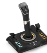
VelocityOne Flightstick for Xbox & PC