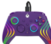
Xbox Series XIS & PC Purple Afterglow Wave Controller