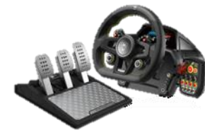
VelocityOne Race Wheel & Pedals System for Xbox & PC

Industry Leading Gaming Accessories Portfolio Built on Innovation & Groundbreaking Technology