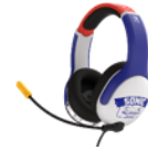
Nintendo Switch Sonic Go Fast Realmz Wired Headset