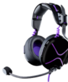
Xbox Series XIS & PC Pro AF Headset