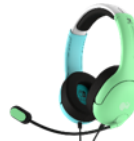
Nintendo Switch Aloha Airlite Wired Headset