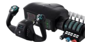
VelocityOne Flight Universal Flight Control System for Xbox & PC