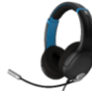
Nintendo Switch Moonlight Black Airlite Wired Headset