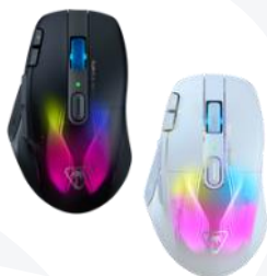
Kone XP Air Premium Wireless Mouse