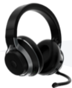
Stealth Pro Ultra Premium Multiplatform Wireless Headset