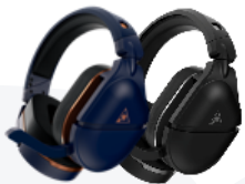
Stealth 700 Gen 2 MAX Premium Multiplatform Wireless Headset