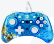
Nintendo Switch Link Rock Candy Controller