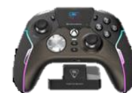
Stealth Ultra Premium Wireless Controller for Xbox & PC