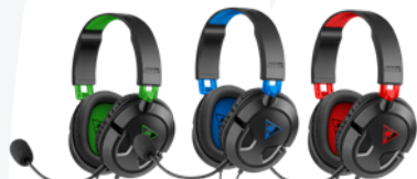
Recon 50 Multiplatform Wired Headset