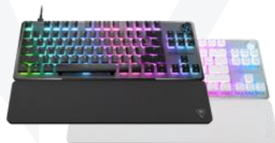
Vulcan II TKL Pro Magnetic Mechanical Keyboards