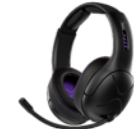
PS5 & PC Victrix Gambit Wireless Headset