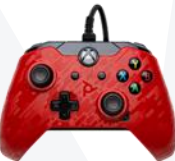
Xbox Series XIS & PC Phantasm Red Wired Controller